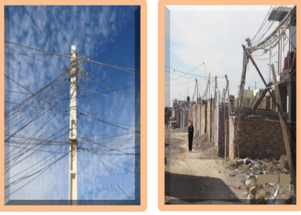
Figure 3. Condition of electrical wiring, passages and buildings of the complex